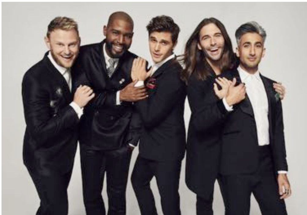
Queer Eye, rebooted for the confidence of humanity.

"It's OK to have a relationship with yourself...you want to have yourself looking together as much as you can," so that one can succeed comfortingly lovingly, says Jonathan Van Ness, grooming artisan.