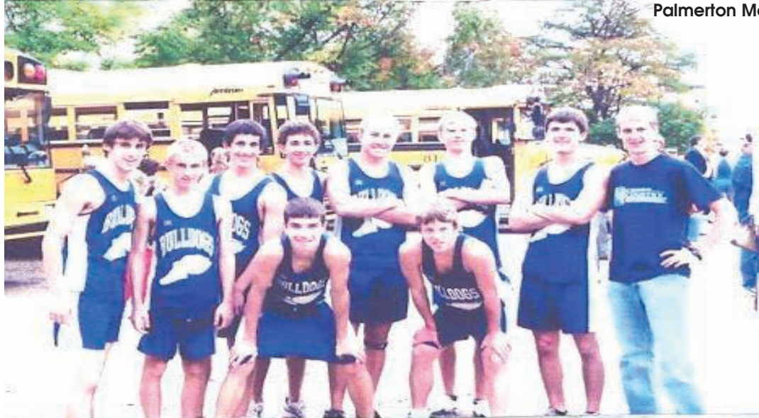
The boys' team poses for a picture at Palmerton's cross country course. Below, the girls gather before their race.