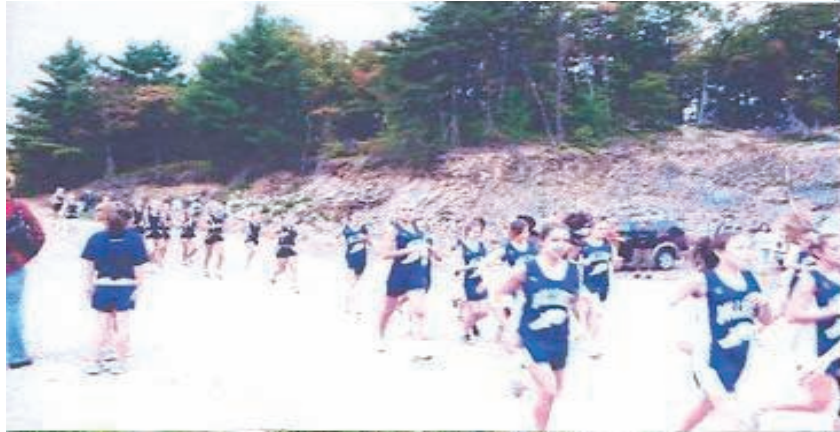
The girls' team warms up before the race.

Some people may wonder why anybody would run for fun, but in fact, the members of the cross country team do; they run 3.1 miles at meets and usually a lot more at practices. What possesses them to run? Perhaps it is the races when everybody gets his or her personal bests or during practices when someone randomly falls; perhaps it is the joy and excitement they feel when their individual and team goals have been achieved. Whatever it is, it is enough for them to reach their goals and have a successful season.